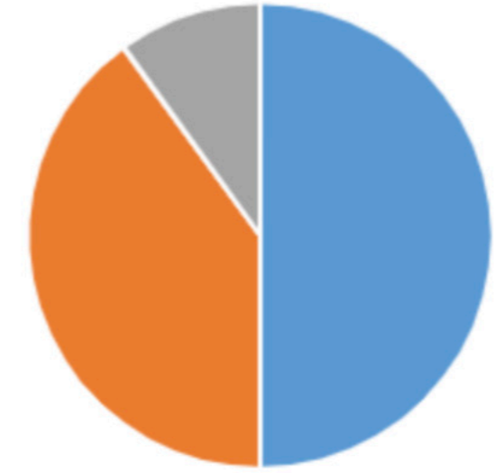
HE Degree Apprenticeships - Degree Classification Awarded

■ 1:1 Degree ■ 2:1 Degree ■ 2:2 Degree below