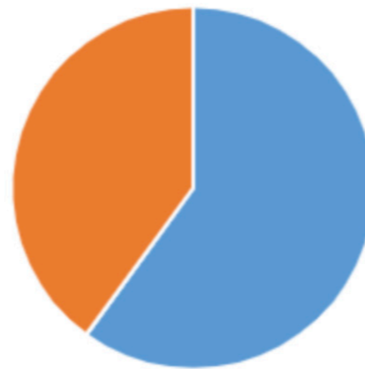
HE Degree Apprenticeships - Gender Breakdown