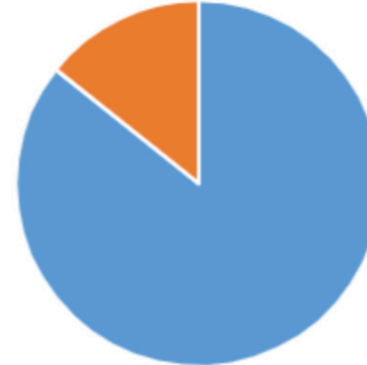
HE Part-time - Ethnicity Breakdown